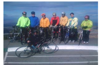
Riders on top of Mt. Diablo