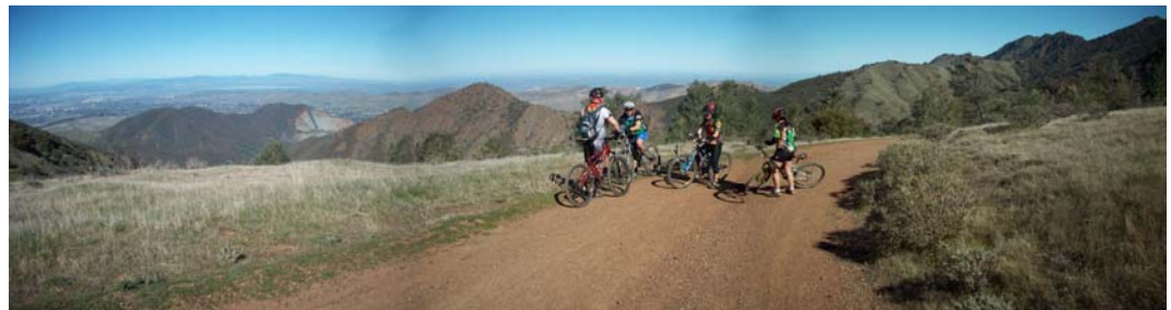
Taking a break on Mitchell Canyon

Our goal is to have at least two of these rides a month along with our road rides. So check the website often for up coming rides or email me at pres@deltaped.org if you wish to be included in our email alerts.